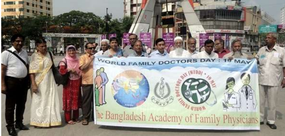
Photo: Members of the BAFP are attending a rally