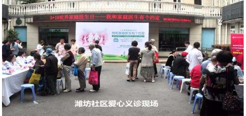
Charity Clinics in Weifang Community Health Center