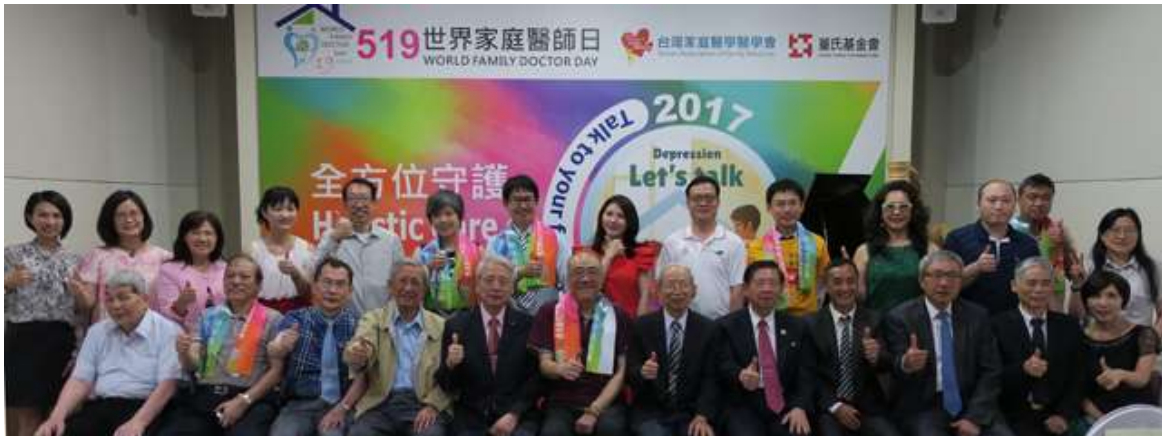
For more information on Taiwan's activities see feature in WONCA News May 2017