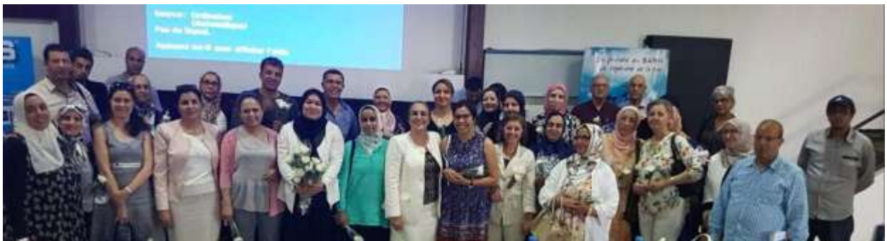
Photos: groups in Rabat

In Morocco they engaged in family physical awareness and distributed white flowers to family doctors.